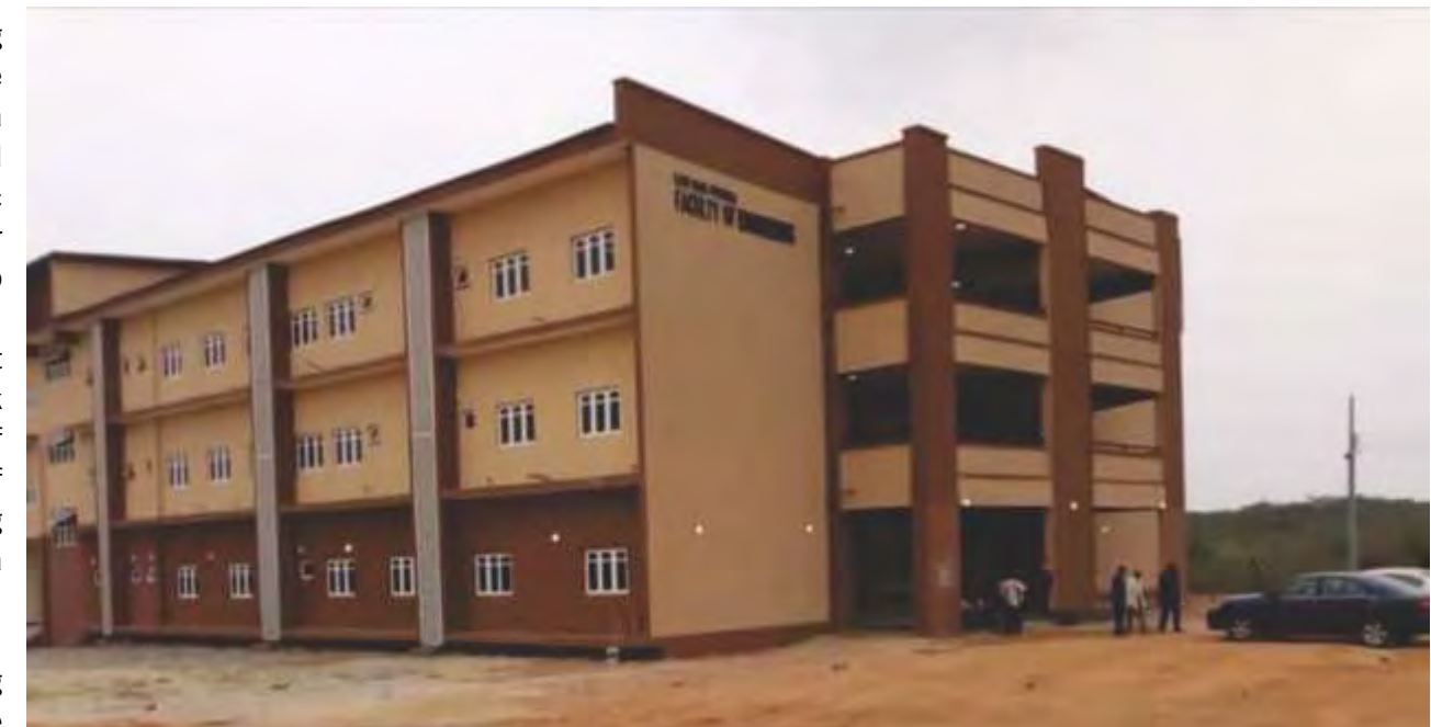
fund raising committee, Augustine University Faculty of Engineering

period for this building will not be more than two years in view of the envisaged rapid growth of the students of the University with the admission of engineering students in the university."