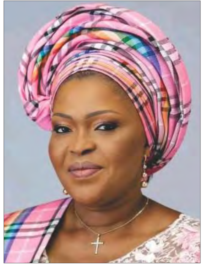
Princess Aderemi Adebowale

According to her, "The Office liaised with the Local Government and Public Health Centres (PHC) and it was discovered that most