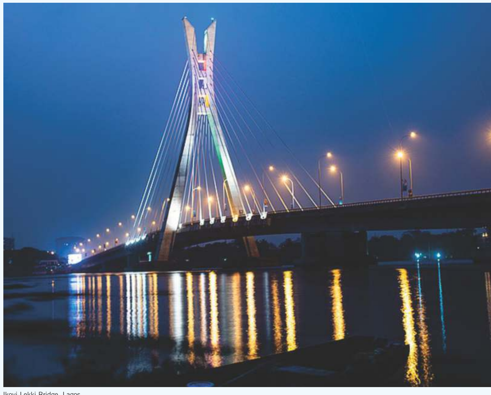
Ikoyi-Lekki Bridge, Lagos

Another factor that contributes to Lagos's status as a top property zone is the city's booming economy. Lagos is home to several industries, including finance, technology,