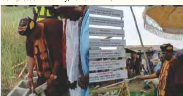
PHC foundation in Agboyi-kute LCDA

He assured the residents the Estate Community The project, which that was delayed by