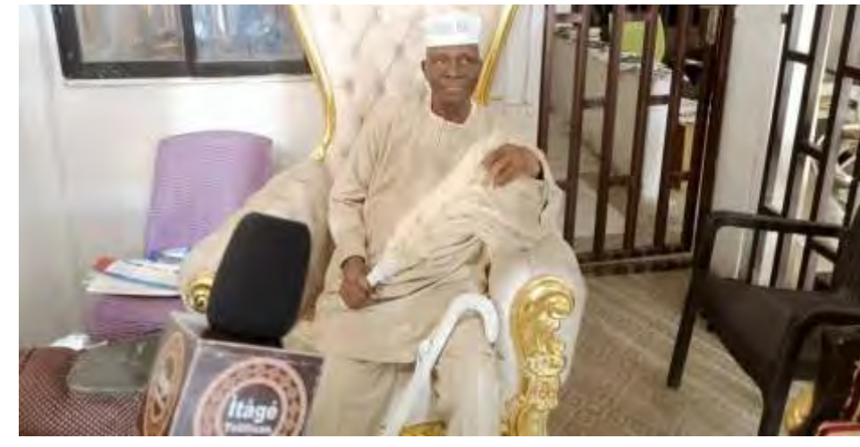
HRM Oba Najim Fashola, Ologudu of Ogudu,