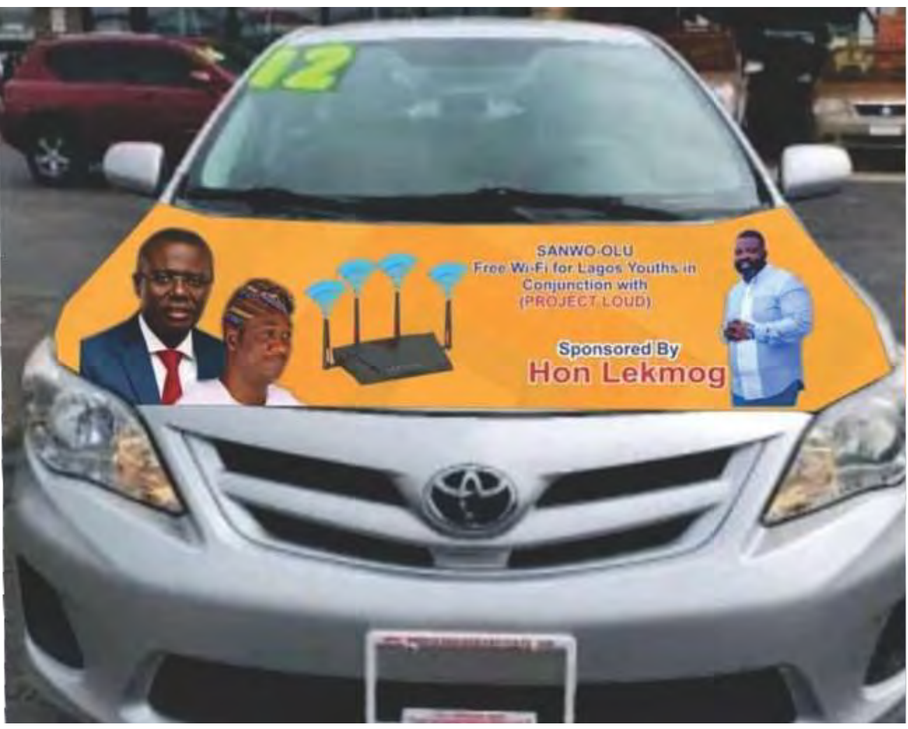
Free Wifi Branded vehicle