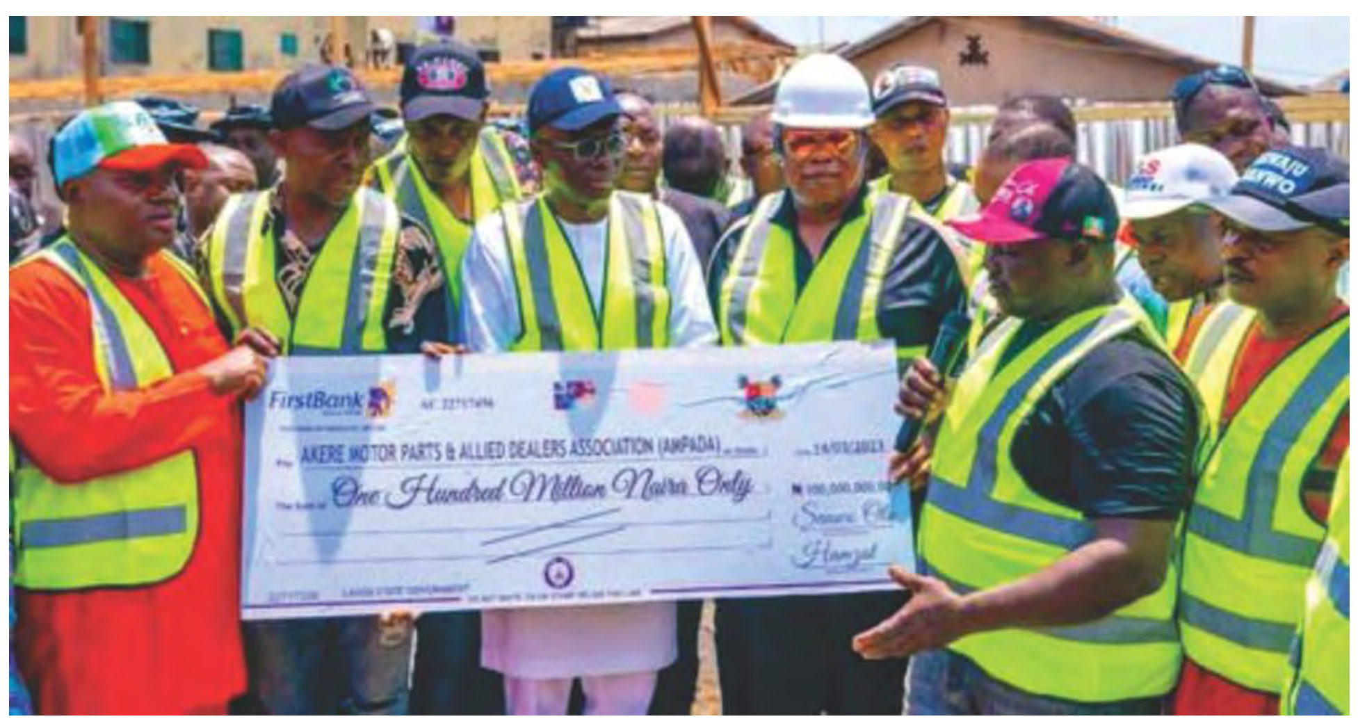
Governor Sanwo-Olu giving out the relieve cheque